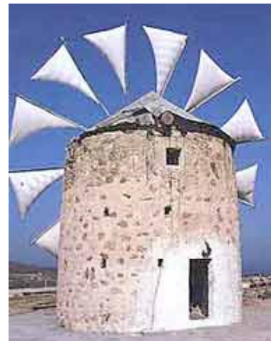
Windmill in Antimachia

After lunch, we will continue to the seaside village of Kardamena stopping shortly for a coffee, and then we will return back to the hotel.